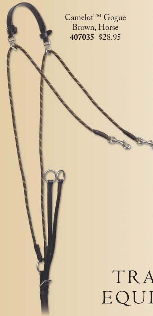
Camelot™ Gogue Brown, Horse 407035 $28.95