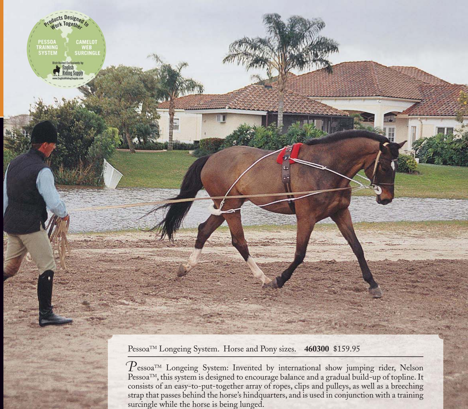
Pessoa™ Longeing System. Horse and Pony sizes. 460300 $159.95

P essoa™ Longeing System: Invented by international show jumping rider, Nelson Pessoa™, this system is designed to encourage balance and a gradual build-up of topline. It consists of an easy-to-put-together array of ropes, clips and pulleys, as well as a breeching strap that passes behind the horse's hindquarters, and is used in conjunction with a training surcingle while the horse is being lunged.